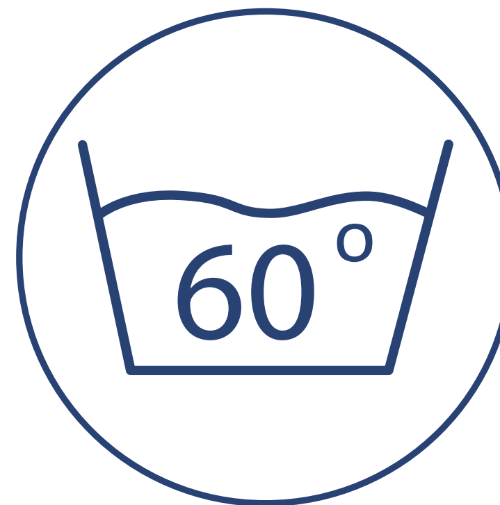
60 degree washable