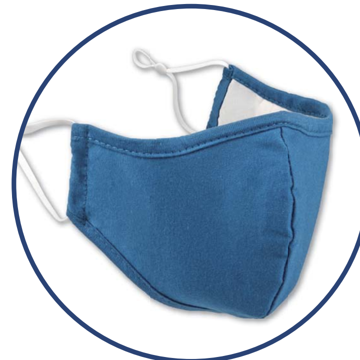
3D shape design

Three-layer protective 100% cotton, 3 layer Reusable & washable at 60 degree Allows easy breathing without restriction Pocket for optional PM2.5 activated carbon filter Secured with adjustable ear loop 3D shape to fit snugly on the face and under chin With nose wire clip In conformity with: CWA 17553 of June,2020 For Non-Medical use One size fits all 24 standard color available Min. qty from 100 pcs