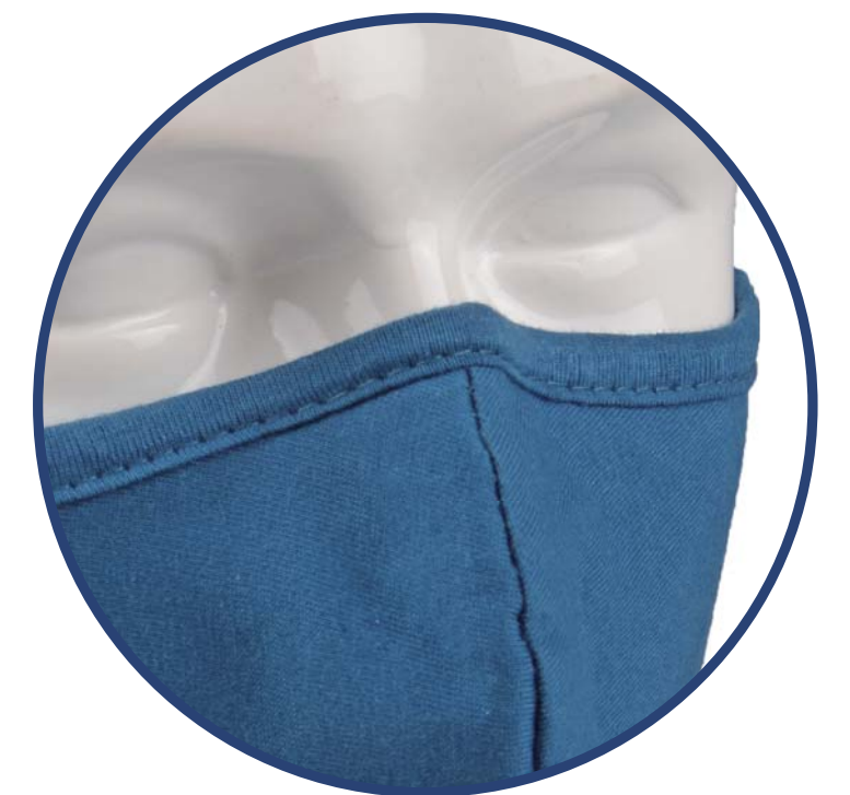
Nose wire clip