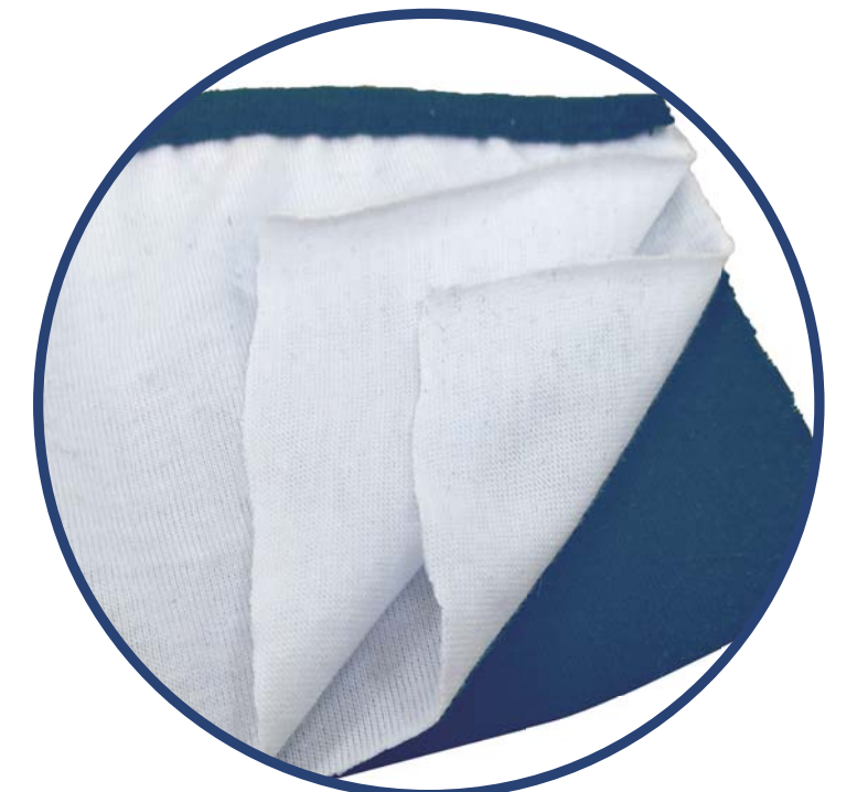
3 Fabric Layers