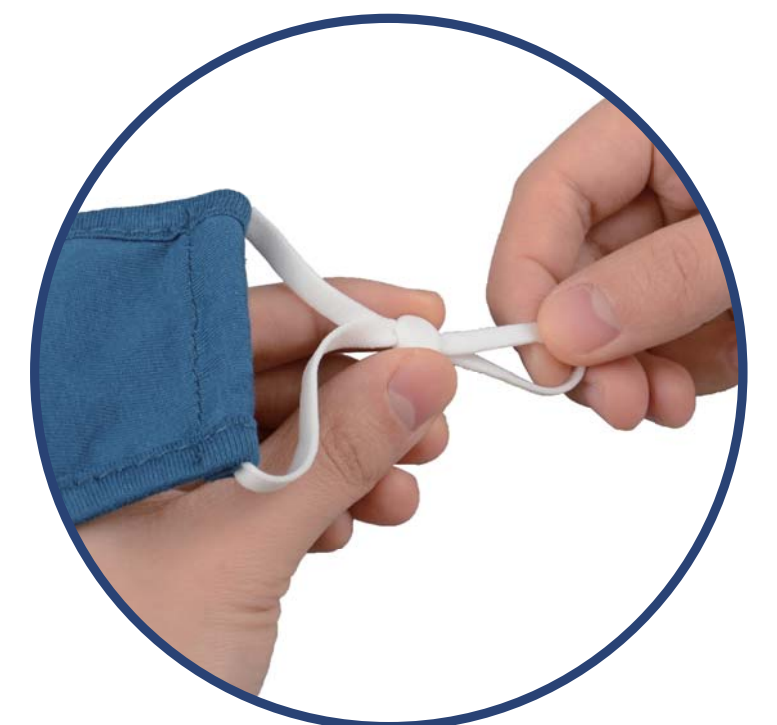
Adjustable ear loops